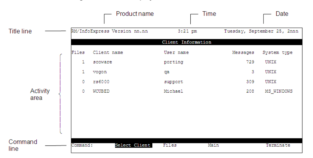
Figure 2: Server Display Screen Format

Except for the main screen (illustrated on the following page), each RM/InfoExpress server display program screen has the same basic format, as illustrated in Figure 2.