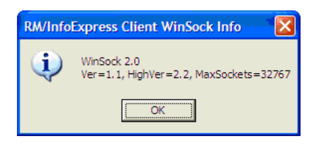
Figure 1: RM/InfoExpress Client WinSock Info Message Box

If no message box appears, the RM/InfoExpress Windows client software is not properly installed or started. Check that the RM/InfoExpress Windows client DLL file ( rmtcp32.dll ) exists in your application installation directory.