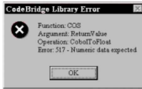
Figure 1: Library Error Message Box

For Windows platforms, a message box with the error message is displayed. Figure 1 shows an example of a CodeBridge Library error message on Windows: